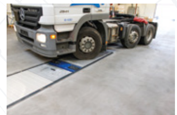
Robust Rolling Cover with 7t Capacity

The cross beams can be stored at floor level in full pit length. The lift is particularly suitable for workshops servicing many different vehicle types.