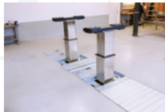
Always The Optimum Working Height

Square lifting rams ensure maximum stability. 2 independent hydraulic circuits in each lifting ram offer optimum safety: One circuit will hold the entire load if necessary.